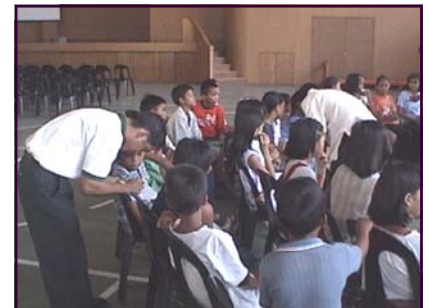
Helping a boy write his name

This morning in our staff devotions as we were commenting on a victory won in the life of one of our challenging students, teacher's from the DVBS began to share things that happened yesterday – which was day two of the week. They were moved by the kids who had never heard of "Jesus", by those who were not even aware of a very prominent Roman Catholic holiday which is part of the Lenten or Easter season. Some of these children were twelve years old, and asking one of the male staff if he could please write their name on their paper for them, "cause I don't know how to write my name". These same children were literally 'awe struck' at holding a brand new crayola and a pencil that had just come out of a real pencil sharpener and was clean and sharp and even had an eraser on the end!